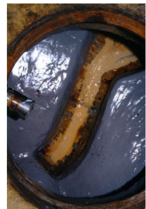
Armaline® 1730 coating in CIP dairy drain manhole.