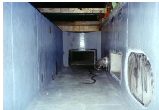
Armaline® Chestline in wire pit under paper machine applied in tight shutdown period. The concrete was not able to be 100% dried and there were frequent water spills.

Heavy duty epoxy tank lining reinforced with a glass fabric and applied to a nominal 2.5 mm thickness. The finished surface is smooth for ease of cleaning and minimum product hang up. Developed especially for lining stock chests in pulp and paper plants. The rapid application and moisture tolerance minimises shut down times.