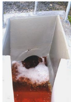
Armaline® 1720 coating on waste water structure.

Armaline® coatings have a good moisture tolerance and will bond to damp concrete and steel substrates. These coatings will continue to cure even if submerged after application. These features make the coatings easy to apply in in-situ applications where it is not always possible to have the substrates 100% dry, and is ideal for maintenance and shut-down situations with tight timetables.