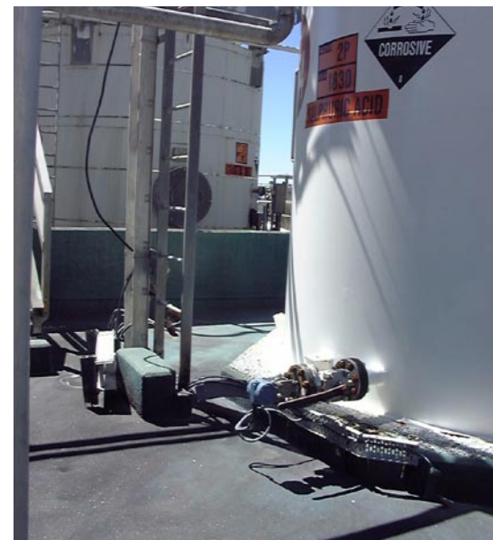
Armaline® 1730 protecting bund from spills of 98% sulphuric acid. The variagated and dark colour of the coating in the foreground shows that it has already been exposed to a substantial spill, but remains intact and has protected the concrete bund structure.

Armaline® coatings are available in New Zealand on short lead times as all materials are held in stock in our New Plymouth factory.