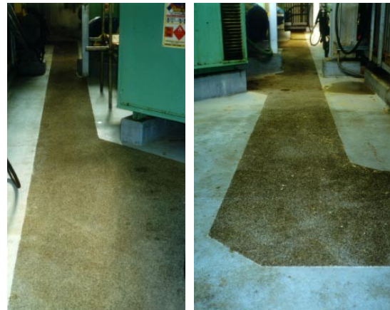
Armaline® Gripcoat on walkway through wet area in Pulp and Paper Plant for personnel safety reasons.

Non-slip safety floor coating that is a two component, modified epoxy coating applied by brush or roller, and with grit broadcast over immediately after the coating is applied. Gripcoat is specially formulated so it can be applied to wet and dry concrete floors to provide a non-slip coating for safety purposes. Grit is available from ARMATEC or you can supply your own to suit.