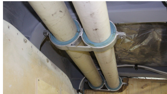
WhispaPipe, with factory fitted acoustic insulation.

ARMATEC marine exhaust tubing, fittings and accessories are manufactured in New Zealand to international standards using materials and technology sourced internationally. Some diameters of tubing and a number of fittings are stocked for immediate delivery. For WhispaPipe, typical lead times for manufacture are 2 to 4 weeks. Typical tubing sizes include 50, 75, 100, 125, 150, 200, 250, 300 diameter and larger sizes.