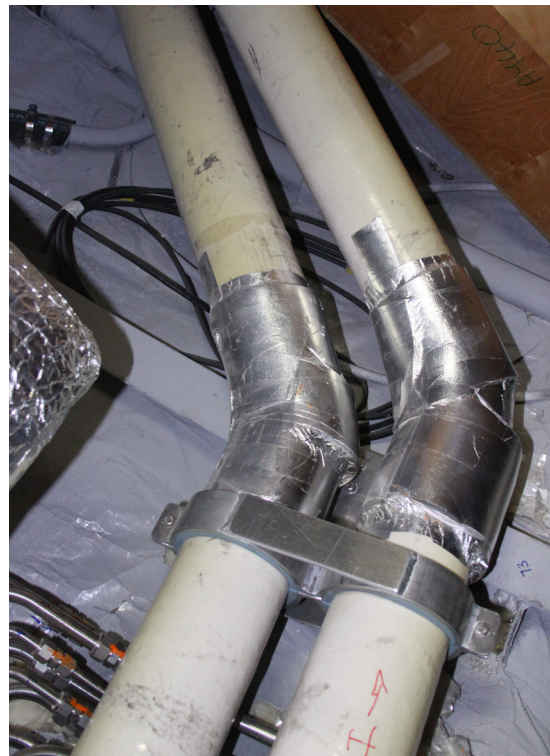
WhispaPipe with butt and strap joints, and acoustic insulation reinstated with aluminium tape.