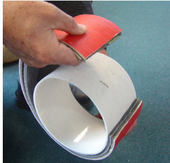
Acoustic insulation is easily removed to allow jointing of lengths of WhispaPipe. Acoustic insulation is then reinstated after jointing.

Due to thermal expansion of the air surrounding the acoustic insulation, provide 3-4mm diameter air holes through the outer pipe at regular intervals of approximately 3 metres. Alternatively, to reduce noise leakage, leave the pipe open to breathe at the ends where noise doesn't matter such as in the engine room.