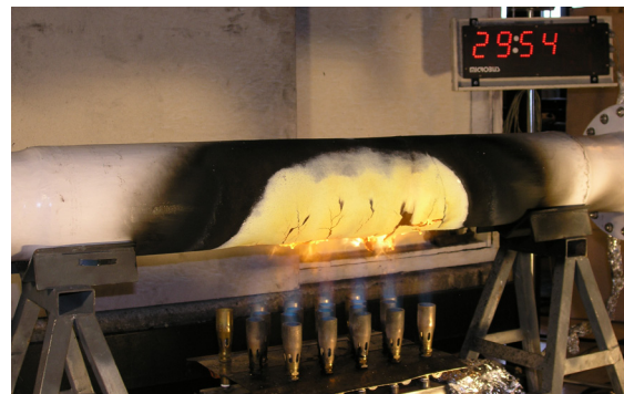
WhispaPipe meets IMO fire endurance tests. Contact ARMATEC or visit website for IMO test certificate.