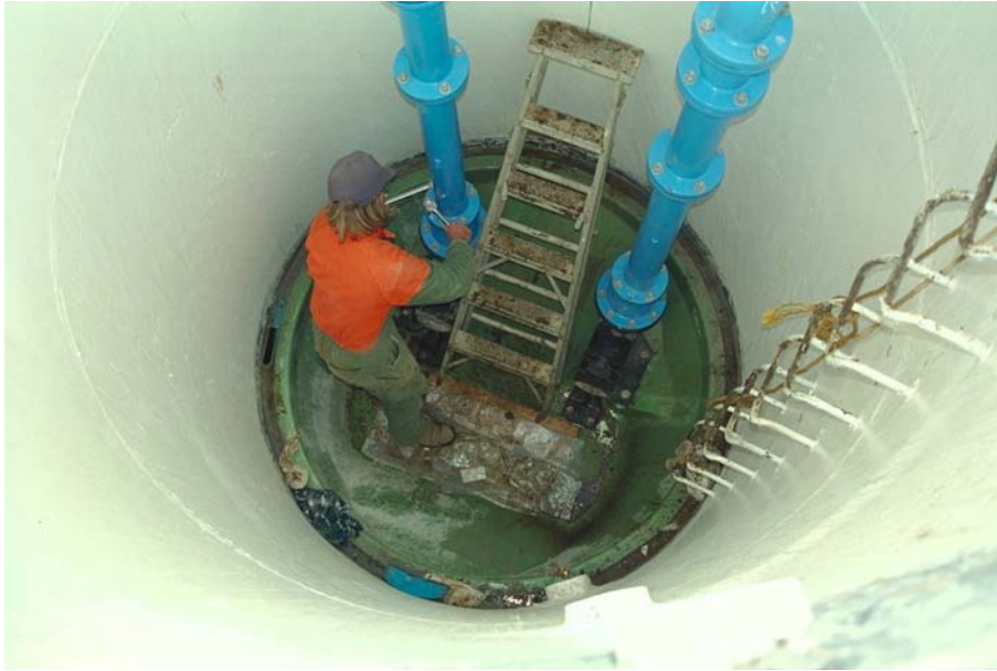
Photograph 6: FLYGT TOPS fiberglass base installed in bottom of new deep pump station. A protective coating has been applied to the wall of this new pump station.