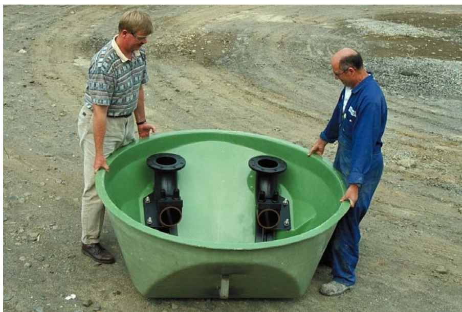
Photograph 5: FLYGT TOPS fiberglass base, with pump seating elbows installed, ready to install

The size of the base is selected to suit both the pumps and the internal diameter of the pump station. Once the manhole is cleared off the existing pumps and piping, the base is lowered to the bottom of the pump station, oriented correctly, and then the cavity between the fiberglass and the pump station wall is grouted with a flowable cement grout.