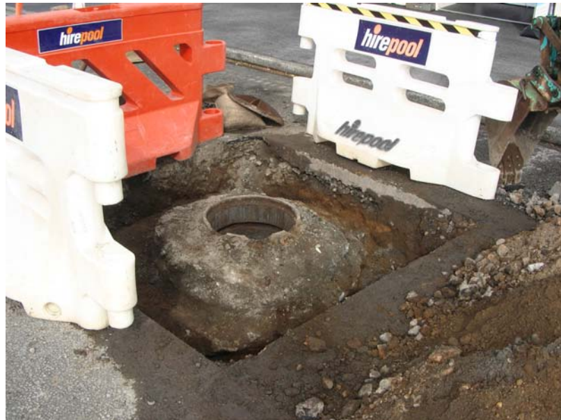
Photograph 9: Top off manhole, and preparing to install fiberglass liner.