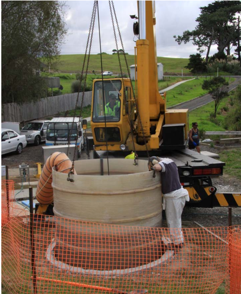
Photograph 10: Lowering a fiberglass liner into position after base is completed.

Once landed, the bottom of the fiberglass liner must be sealed to the base, so that grouting of the annulus between the existing structure and the fiberglass liner can be done. The first step in this process is to fill any gaps, and this can be done with a variety of materials including foam, putty and trowelable grout. Then a fiberglass bandage is applied from the liner to the base, and allowed to cure.