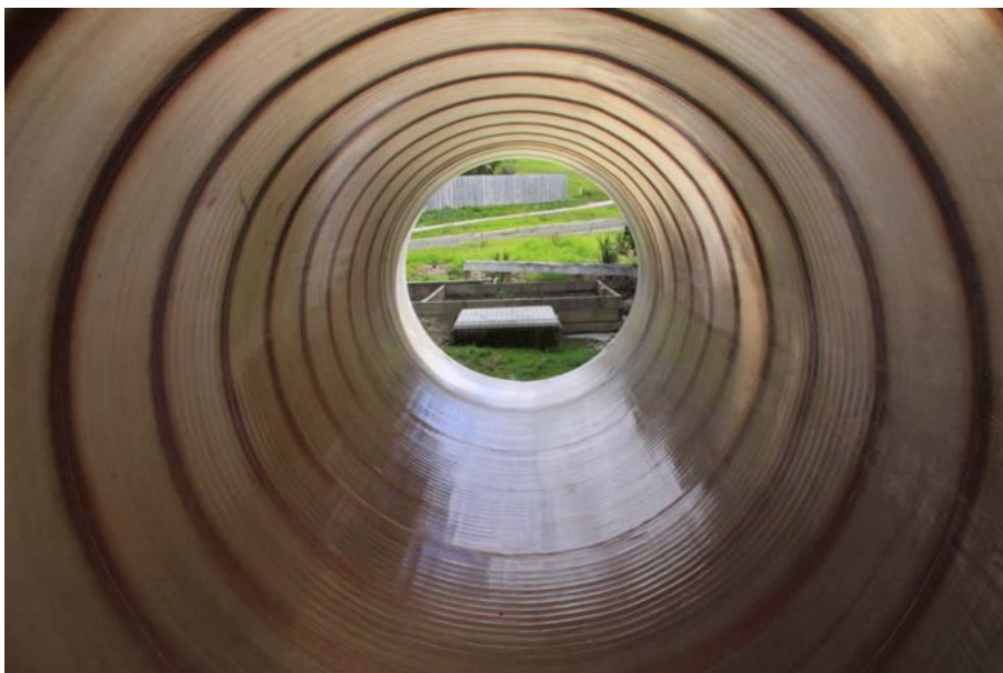
Photograph 7: Fiberglass liner ready to install. The dark rings are external stiffening rings to resist buckling during grouting after the liner is installed.

The fiberglass liner is custom manufactured to suit any diameter and depth. The thickness of the fiberglass liner is custom engineered, from 6mm upward, to resist buckling during grouting after installation. The fiberglass liner can be designed to provide as much additional structural strength as needed. Isophthalic polyester resins are used for municipal sewerage systems, and vinyl ester resins are used for industrial systems handling CIP chemicals.